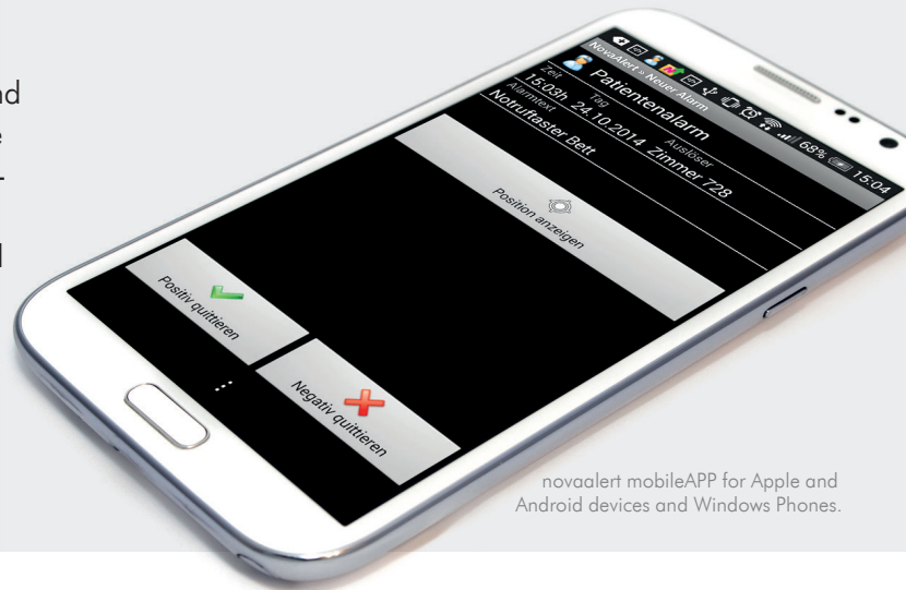
novaalert mobileAPP for Apple and Android devices and Windows Phones.