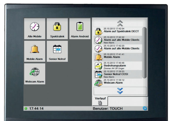
novaalert Touch panel

The touch screen monitor can be installed in emergency services (blue light) vehicles, sentry boxes, mission control centres and in security organisations for instance.